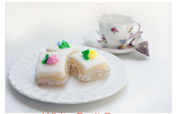
White Petit Fours

Downtown Torrance 1341 El Prado Avenue Torrance, CA 90501 (310) 320-2722 info@torrancebakery.com