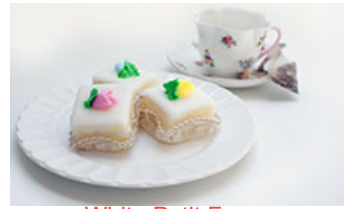
White Petit Fours

Downtown Torrance 1341 El Prado Avenue Torrance, CA 90501 (310) 320-2722 info@torrancebakery.com